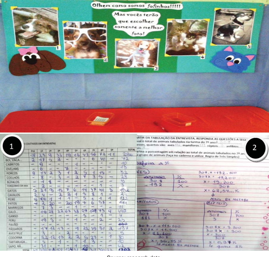
FIGURE 3 – Problem-situation that generated involvement of other subjects.

In teacher S6's school, the science teacher decided to participate and organized a photo contest with the pets, as the Portuguese teacher organized an essay contest titled "My pet is awesome". Figure 3 illustrates part of the work<sup>2</sup> performed on teacher S6's school.