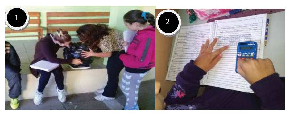
FIGURE 2 – Situation generated by field research.