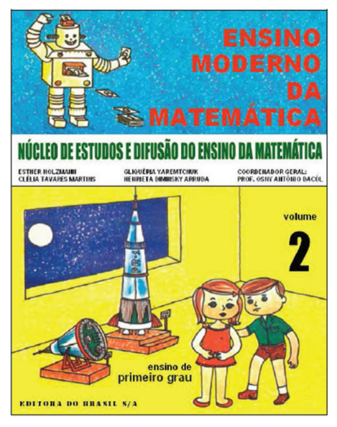
Figure 4. Cover Book of NEDEM for Primary – Volume 2. (NEDEM, 1971).

[...] in the covers of the editions for the initial years of schooling, images that allude to the technological development that was lived at that time; besides the images and the introductory texts that show the progress of technology, rocket and robot drawings are marks of the didactic publications that were produced by its members for use in schools.