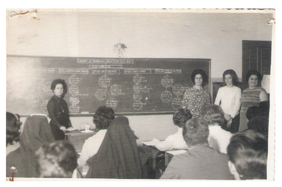
Figure 2<sup>14</sup>. Course of Modern Mathematics – Colégio Agostinho Pereira . <sup>15</sup>

Based on the theories of Dienes in the 1970s, NEDEM developed an intense work with logical blocks in primary education. For example, the use of Logical Blocks in school units of the Municipal Teaching Network of Curitiba (RMEC) was indicated as an enriching action of the teaching and learning process and given its importance was distributed in schools. The use of logical blocks was also taught to the primary teachers at the Institute of Education of Paraná (Portela, 2009).