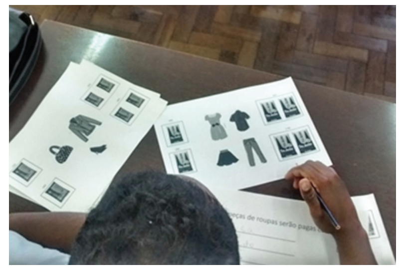
Figure 1. Learning Laboratory - price ratio.

Phase 3 was directed to experience the LL routine, following the work daily and observing participants in the context of the LL.