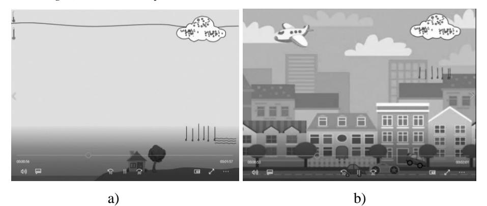
Figure 1b shows a frame of this second animation with cognitive overload. Excessive graphic elements and movements were added to the animation to divert the student's attention. We also added city traffic noise, the movement of cars and planes, and narration with a machine voice out of sync with the events of the animation. During the animation, students hear a crash

Animation about how lightning forms, produced for the experiment: a) "clean lightning animation": following the principles of the cognitive theory of multimedia learning; b) "dirty lightning animation" with cognitive overloads that do not follow the principles of the cognitive theory of multimedia learning. (Based on Mayer, 2009)