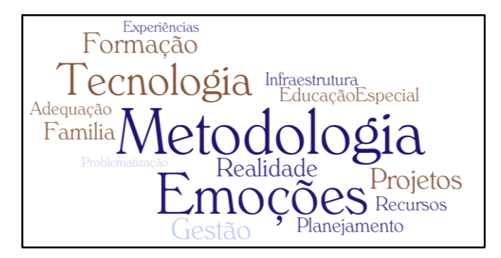
Figure 3 Word cloud about teachers' training needs. (Prepared with the wordart.com tool)

The similarity of both questions is evident, but Table 5 reflects the teachers' desires for better development of their classes in an explicit way, and Figure 2 mentions the formative needs of the teacher in general. There is a close relationship between "Methodological diversity" and "Methodologies", as well as "Emotional well-being" related to the teacher's "Emotions". It is also necessary to talk about the infrastructure to develop classes because many teachers reported the importance of a good internet signal and equipment that provide digital technological fluidity in the classroom.