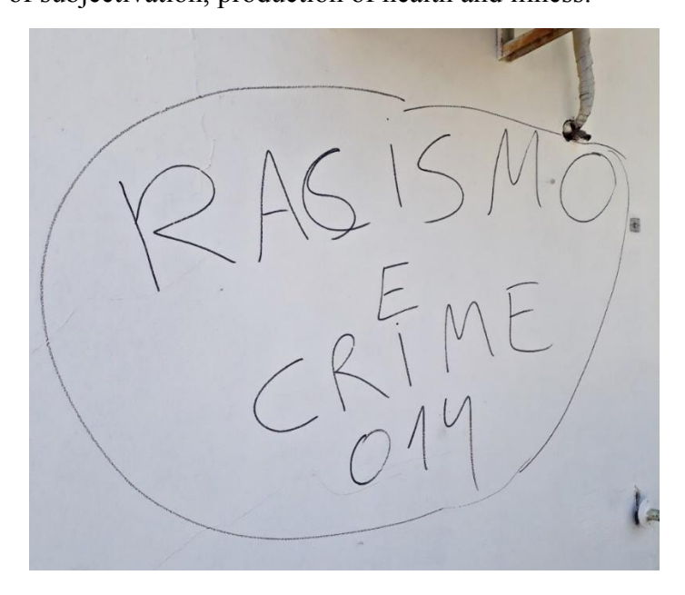
Figure 2. Speech written on a wall in the city of Porto Alegre (RS) "Racism and crime 014".

Thus, with regard to diagnoses of mental disorders, the Diagnostic and Statistical Manual of Mental Disorders (DSM) and the ICD do not contain criteria that consider the historical and current effects of racism in the production of illness in populations. In this logic, considering such diagnoses for blacks as a practice of institutional racism, it is proposed to think that they have repercussions in social life, in the way the person is seen and recognized, in how valuation systems are established and the experiences of socialization, when we oppose the effects of the diagnoses of Mental Disorders to the idea of Santos (2016) and the Ministry of Health policy (2017) on racism. When operating as institutional racism, the diagnosis of mental disorder will imply, directly or indirectly, different ways of being, existing and thinking, superimposed on the subjects, their processes of subjectivation, production of health and illness.