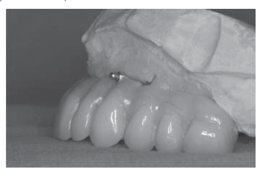
FIGURE 3 - Acrylized implant-supported fixed prosthesis with male fitting in place

A diagnostic wax-up on the framework was then performed, since attachment male threads were welded in the ideal position. Upon verification and approval by the patient, at the prosthesis laboratory the acrylic resin of the fixed prosthesis was pressed, the removable gingival veneer was characterized and the retaining caps were captured in the gingiva (Figures 3 and 4).