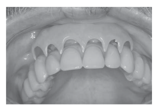
FIGURE 5 – Implant-supported fixed prosthesis in place.

The fixed prosthesis was screwed into the abutments with a tightening torque of 20 N/cm² applied to each screw. The patient received instructions in oral hygiene procedures in the cervical area of the prosthesis and also on how to insert and remove the detachable gingival veneer (Figure 5). Screw access holes were sealed with composite resin, and occlusal adjustment was then performed (Figure 6).