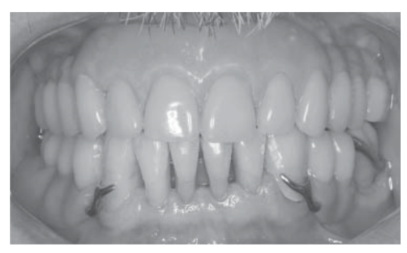
FIGURE 6 – Final appearance of the implant-supported fixed maxillary prosthesis with attachment-retained removable gingival veneer