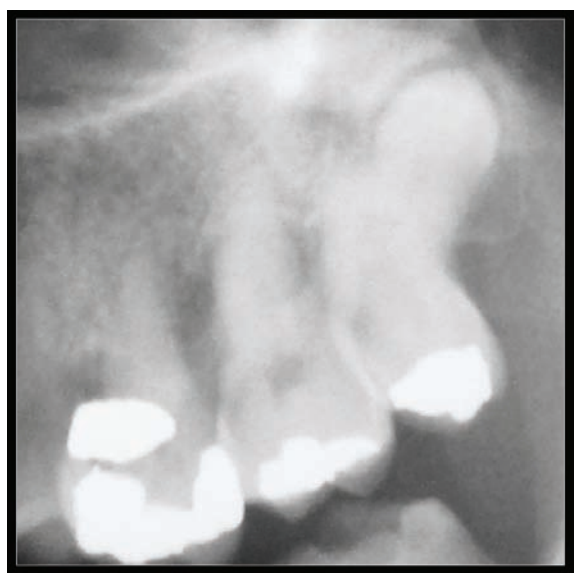
FIGURE 1 – Cropped panoramic radiograph showing a radiopaque object distal to the left maxillary third molar, with characteristics suggestive of a supernumerary tooth or a cementoblastoma.

A 47-year-old black woman was referred to our oral radiology center (Faculdade de Odontologia de Piracicaba, Universidade Estadual de Campinas, Piracicaba, Brazil) for panoramic radiographic imaging, as the first step in planning for dental implant treatment. When analyzing the image, we noted a radiopaque object, distal to the left maxillary third molar, with characteristics suggestive of a supernumerary tooth or a cementoblastoma (Figure 1).