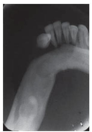
FIGURE 2 – Occlusal radiograph showing floating teeth in the anterior region, and discrete expansion of the bone cortex.