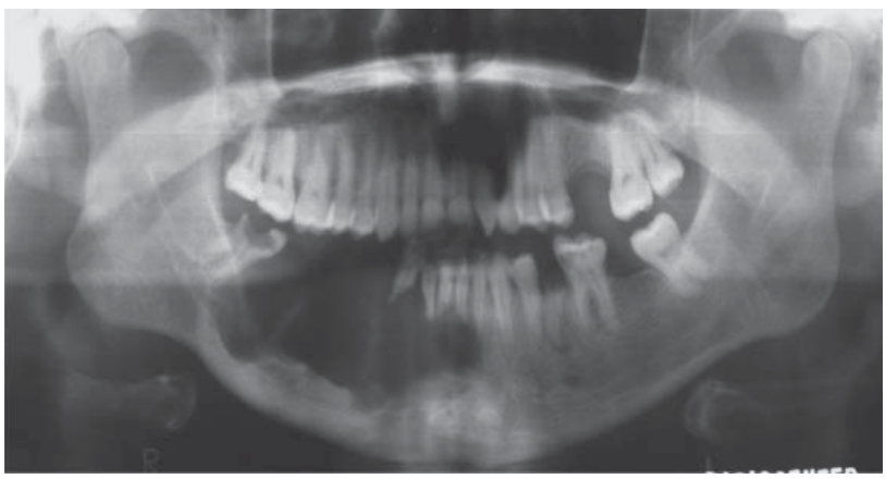
FIGURE 1 – Panoramic radiograph showing an extensive multilocular radiolucent lesion in the right mandible with tooth loss in the area.

A 40-year-old white male patient was seen at the radiology clinic for evaluation of an asymptomatic swelling on the right side of the lower face. Panoramic radiograph showed radiolucency from the lower right third molar to the left central incisor (Figure 1). Inferiorly, bone resorption extended to the inner cortex of the lower margin of the mandible. A multilocular area with undulating borders and bony septa was identified. The location of the mandibular canal could not be determined. The Lower right premolars, first molar and second molar were missing. The lower central incisors and the right lateral incisor and canine exhibited external root resorption. Occlusal radiography showed minimal expansion of the bone cortex (Figure 2). Incisional biopsy findings suggested a diagnosis of granular cell ameloblastoma.