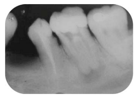
FIGURE 1 - Baseline radiograph of tooth 36.

A 46-year-old Caucasian female patient with unremarkable medical history was referred for endodontic treatment of tooth 36 due to periapical inflammatory disease visible on radiograph (Figure 1).