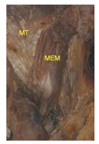
FIGURE 1 – Conventional dissection of the sphenomandibular muscle: temporal muscle (TM) and sphenomandibular muscle (SM).

Five human cadavers (ten anatomical sets) were dissected in the Department of Anatomy at the Pontifical Catholic University of Goiás for the purpose of revealing the topography of the temporal and sphenomandibular muscle. Studies were conducted by the use of both reflection and conventional techniques (Figures 1 and 2), as well as transverse sectional slicing (Figures 3 and 4).