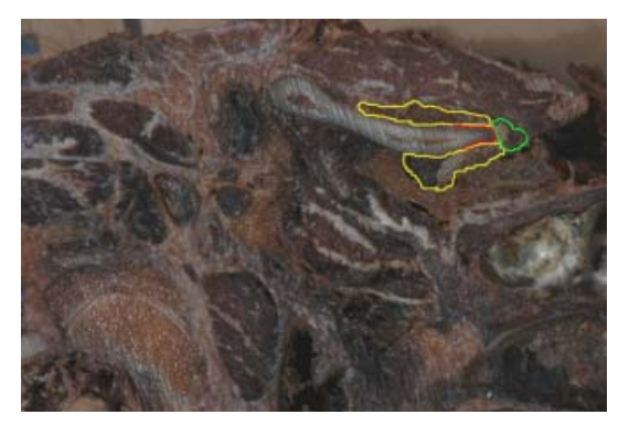
FIGURE 3 – Dissection with cross-section of human skull. Temporal muscle outlined in yellow; insertion of the sphenomandibular muscle outlined in green; coronoid process outlined in red.