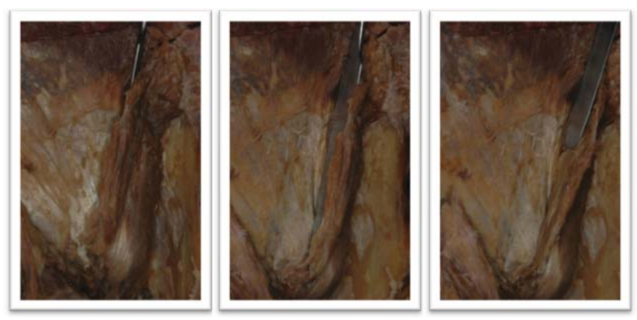
FIGURE 2 - Reflection of the sphenomandibular muscle showing separation by a fascia.