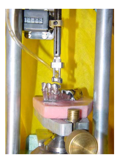
FIGURE 2. Insertion/removal cycling apparatus.

for 5800 cycles (corresponding to 5 years) at a speed of 32 rpm speed (15) (Figure 2). Each pair was immersed in artificial saliva (saliveze, Wyvern Medical Limite, Herefordshired, United Kingdom) for one hour to simulate lubrication found in the oral cavity. Each pair was then positioned in an insertion/ removal cycling machine which was vertically directed. Artificial saliva (8 drops/min) was applied throughout the insertion/removal test (10).