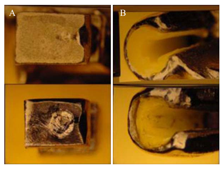
FIGURE 1. A) Plastic insert precision attachment, B) Metal-alloy precision attachment

Two extracoronal precision attachments were used in this study, with 10 samples per each group: The first group used plastic insert (PI) precision attachment (ROD, Servo Dental, Hagen, Germany) consisting of 4.0mm-height plastic burnout cylindrical patrix/matrix elements with a nylon insert (Figure 1A) and metal-alloy (MA) precision attachment (Microfix) (Odontofix, Ribeirão Preto, Brazil) consisting of 3.0mm-height metallic (nickel-chromium) cylindrical patrix/matrix elements (2, 10) (Figure 1B). Both are extracoronal, adjustable precision attachments being two of the most common connecting elements in use in Brazil (15). The patrix portions of both precision attachments were positioned distal to the canine and along the edentulous space with the aid of a paralleling device (Frasgerat F1, Degussa, Essen, Germany). All wax patterns were carefully removed, invested (Virovest, Bego, Petrópolis, RJ, Brazil), and cast with the same Ni-Cr alloy according to manufacturer's recommendations.