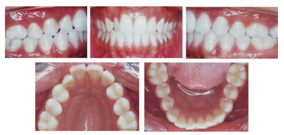
FIGURE 1 - Pretreatment intraoral photographs.

Radiographs revealed impaction of both maxillary canines and severe root resorption of the maxillary left lateral incisor (Figure 2). CT was then required to assess the degree of root resorption in adjacent teeth. Axial and sagital CT scans confirmed the presence of severe root resorption of the left lateral incisor and also revealed resorption involving the apical and middle thirds of the right first premolar. Both maxillary impacted canines were positioned buccally. After careful evaluation and discussion with the patient and her parents, we made a decision to extract the two resorbed teeth (left lateral incisor and right first premolar) and to use orthodontic therapy to induce the eruption of maxillary canines.