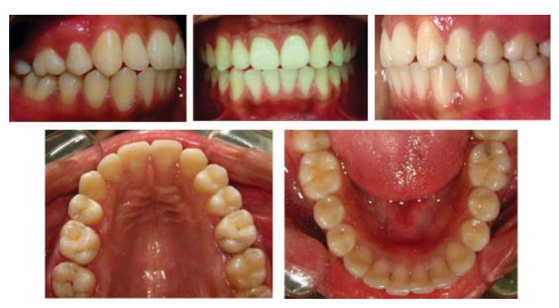
FIGURE 5 – Post-treatment intraoral photographs showing results after extraction of the lateral incisor (tooth no. 22) and the first premolar (tooth no. 14).